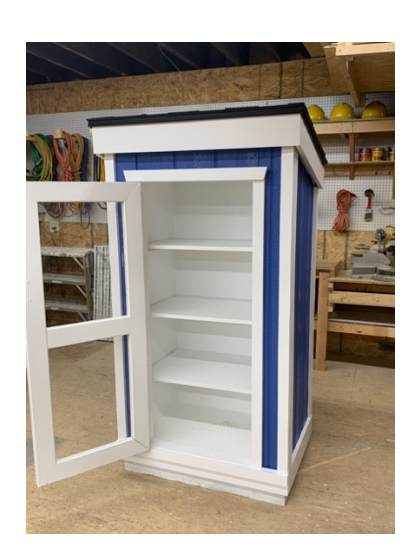
Live Healthy Appalachia using recovery funds to feed community members The Project REBUILD community blessing box